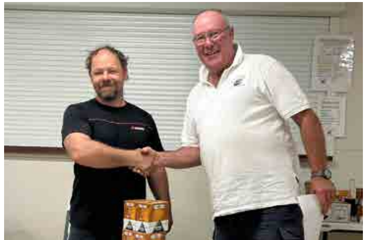
Harvest 100 C Grade