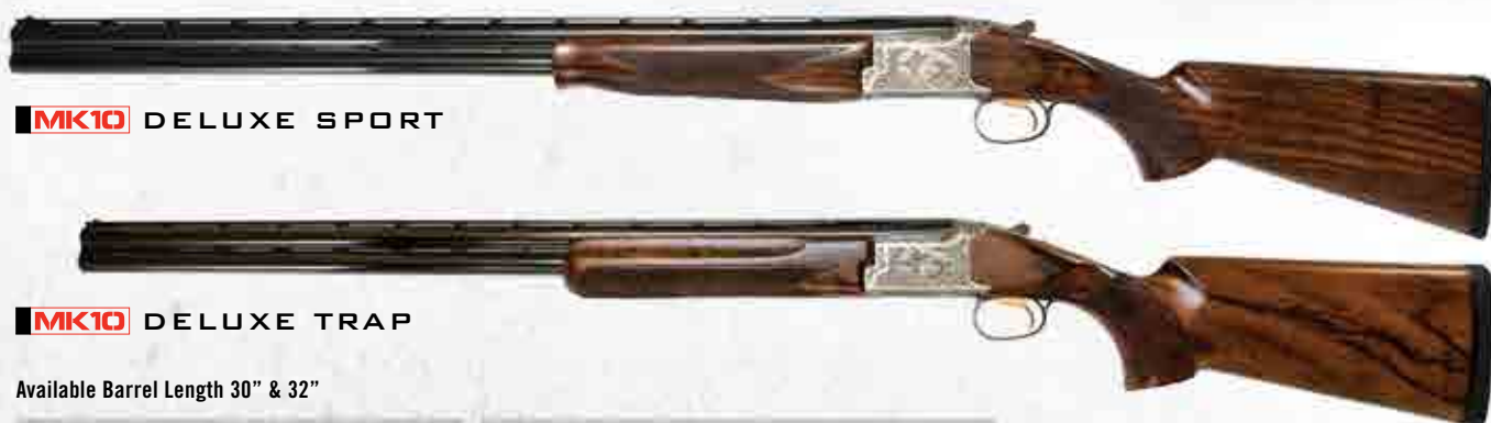
MK10 DELUXE SPORT