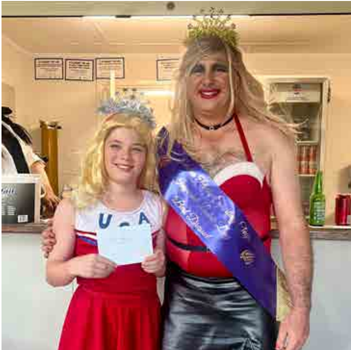
Ladies Day Best Dressed