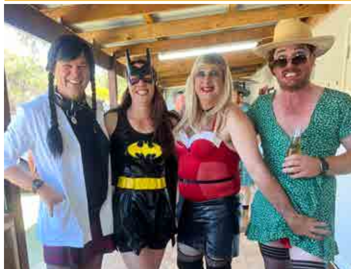
Club members committed to the cause