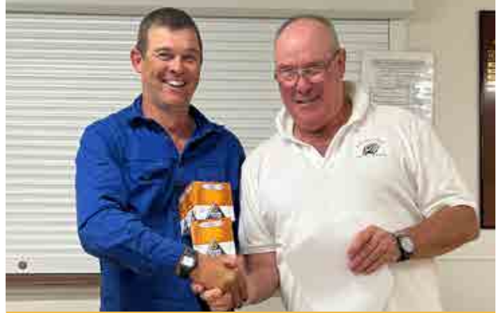
Harvest 100 B Grade