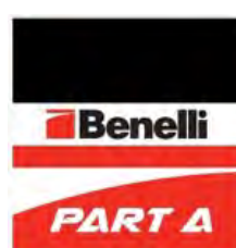
Ground 6 - Benelli