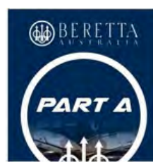
Ground 2 - Beretta