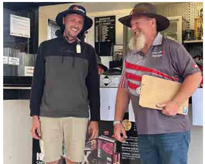
Off the gun