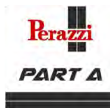
Ground 4 - Perazzi