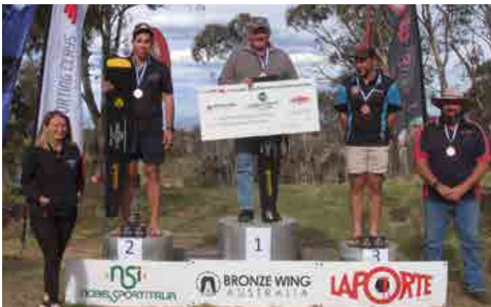
Overall Winners Presentation