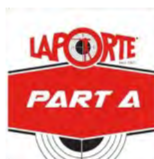
Ground 1 – Laporte