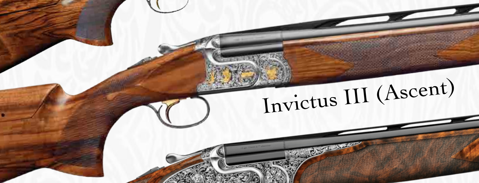
Invictus III (Ascent)