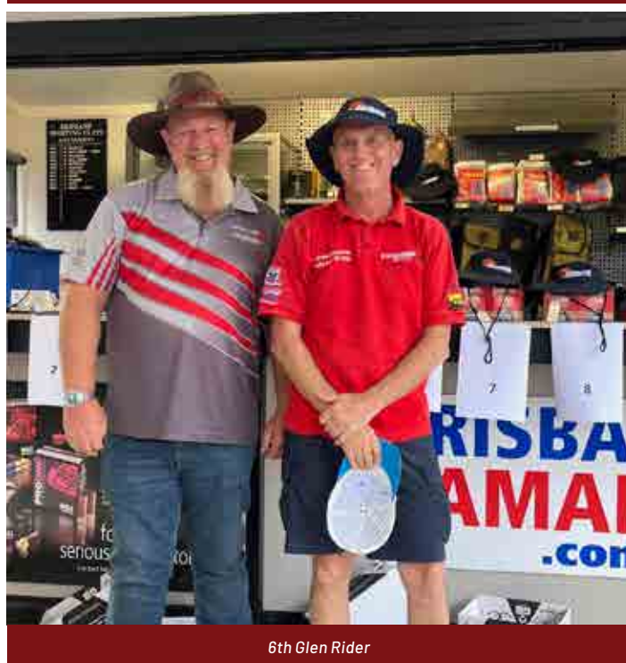
6th Glen Rider