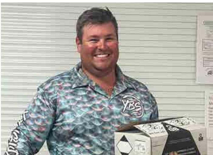
Harvest 100 High Gun