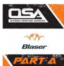
Ground 7 - Blaser