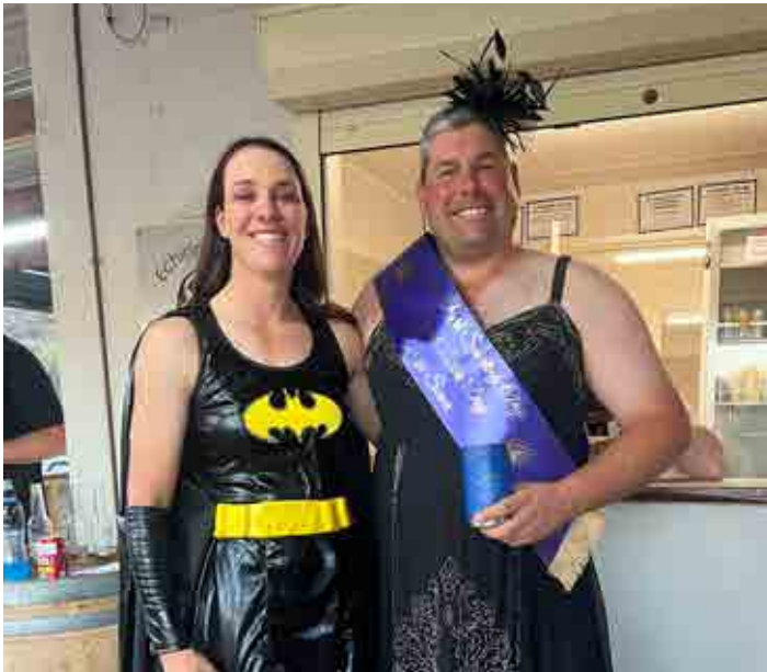
Ladies Day High Score