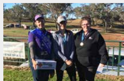
State Selections – Ladies placegetters