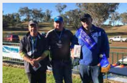
State Selections – B Grade placegetters