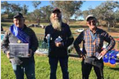
State Selections – Veteran placegetters