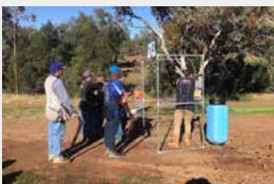
A shooter takes aim

On Sunday 2 July we held our Annual Charity Shoot for the Westpac Rescue Helicopter Service with 91 shooters turning up to shoot the event. The course was tweaked from the previous day to include more pairs. A great day was had by all, raising over $4000 for the Westpac Rescue Helicopter.