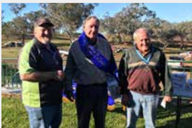
State Selections – Super Veteran placegetters