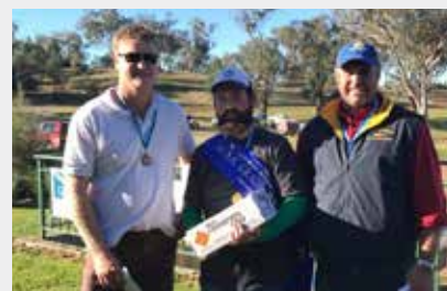
State Selections – AA Grade placegetters