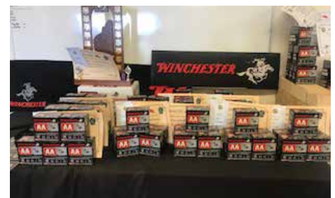
The presentation tables were a sea of Winchester ammo.