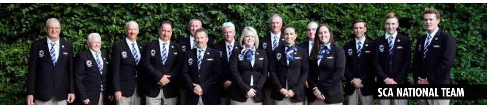
SCA NATIONAL TEAM

Visit us online www.sportingclaysaustralia.com.au