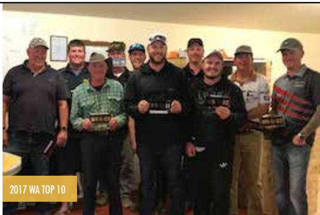
2017 WA TOP 10