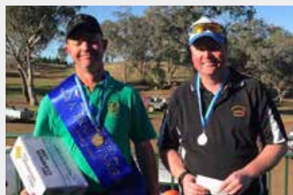
State Selections – A Grade placegetters