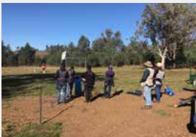
Around the grounds