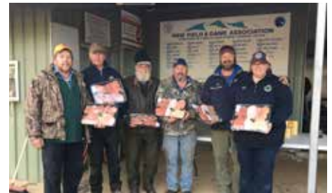
Cooma Field and Game won the second round of the Interclub Challenge but couldn't make up the deficit from the week before.

Sunday saw the second leg of the Interclub