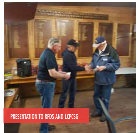
PRESENTATION TO RFDs AND LCPCSG