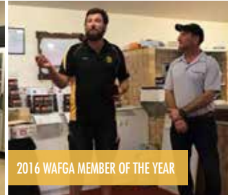
2016 WAFGA MEMBER OF THE YEAR