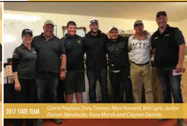
2017 STATE TEAM