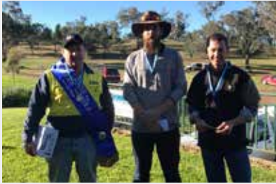
State Selections – C Grade placegetters