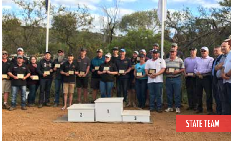
New South Wales (2nd - 1169), Victoria (1st - 1247) and South Australia (3rd - 1159)