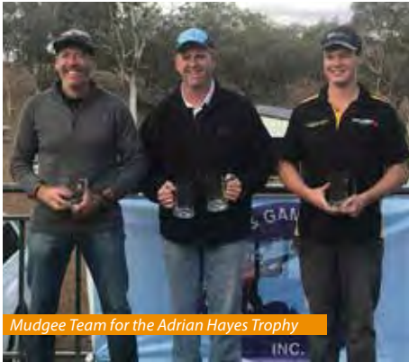
Mudgee Team for the Adrian Hayes Trophy

our amenities block which we hope will be up and running for the 200-300 shooters attending Gumtree. The club is in a good position with an energetic Committee and increase in members. We are always utilising the clubs profits for improvements for our members and guests.