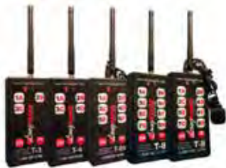
LONG RANGE REMOTE CONTROLS as used at the 2018 GRAND PRIX