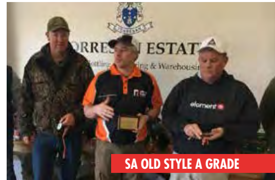
SA OLD STYLE A GRADE

such as a rabbit that kept stretching out over the four pads on parcours 2, but it appeared to be course 5 that brought most shooters undone. With some quick straight birds and a couple of tricky sim pairs, gun hold and shot selection were key factors and it was easy to make a mistake.