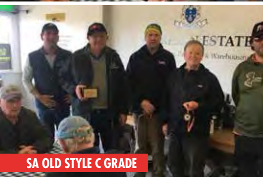
SA OLD STYLE C GRADE