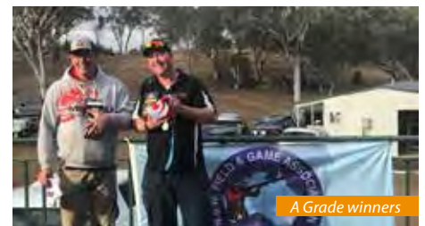
A Grade winners