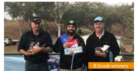
B Grade winners