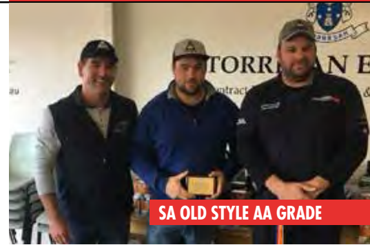
SA OLD STYLE AA GRADE