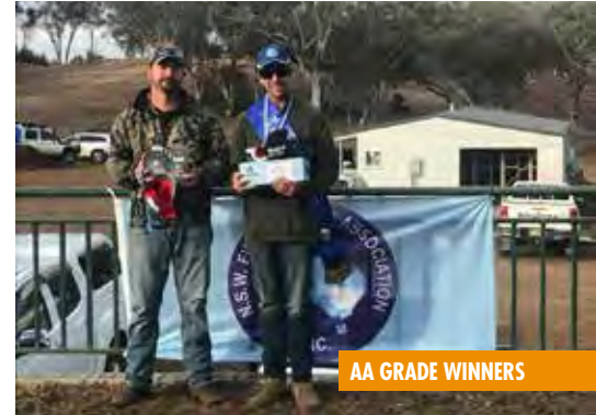
AA GRADE WINNERS