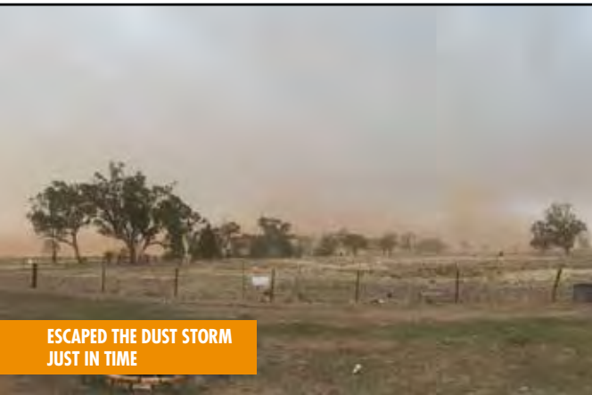
ESCAPED THE DUST STORM JUST IN TIME

Gunnedah Sporting Clays held the 4th State Selection Shoot on the 30th June, with 69 shooters attending from all over the State. Weather was good; targets were great with most shooters scores in their respective grades.