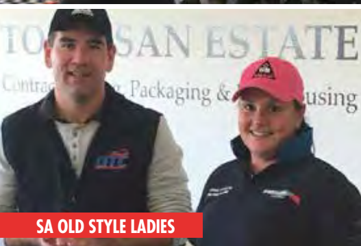
SA OLD STYLE LADIES