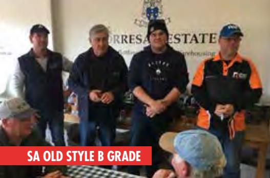
SA OLD STYLE B GRADE