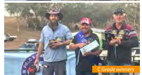
C Grade winners